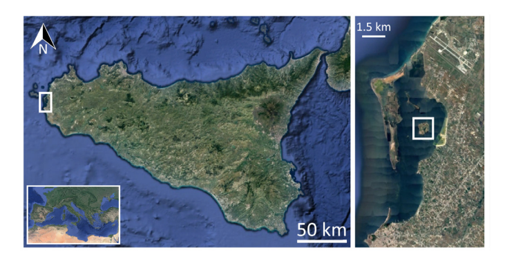
Fig. 1 - The geographical setting of Motya with Sicily and within the Marsala Lagoon. \,

to the 8<sup>th</sup>- first half of the 6<sup>th</sup> centuries BC. Pits F.7057 and F.7012 were only studied in terms of macro-remains (seeds, fruits, and charred wood), while palynological analyses were also performed on samples from pit F.1112, one per each filling layer. These were collected sampled taking necessary precautions to avoid contamination. The choice of studying pollen and NPPs only in the disposal pit was motivated by F.1112 being comprised of multiple layers, therefore providing the possibility of obtaining a palynological sequence (which was impossible for the "sacred" contexts, represented by one stratigraphic unit each).