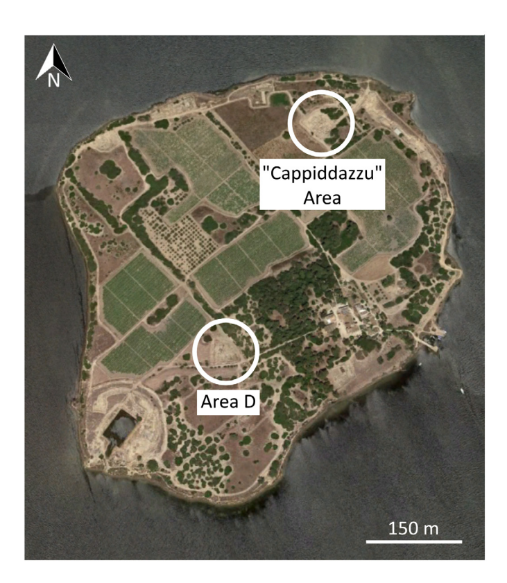
Fig. 2 - The excavation areas taken in consideration in this study: "Cappiddazzu" Area and Area D.

A total of 333 L and 41 L of sediment, respectively from pit F.1112 and the sacred contexts, were processed and analysed for macro-remains. Their separation was performed using the flotation technique, where the lighter