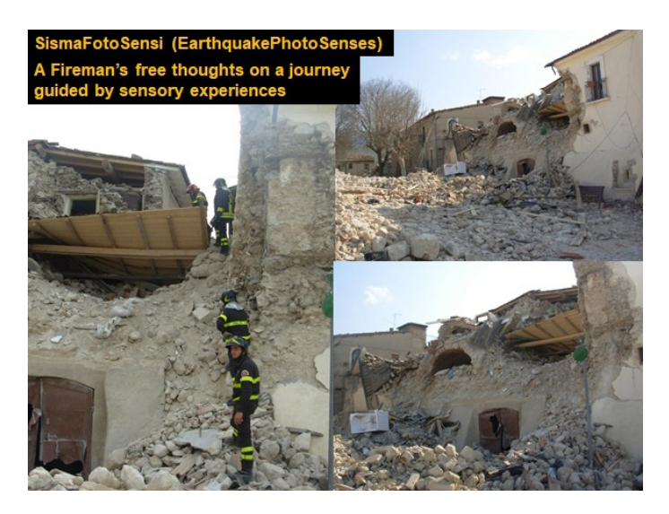
Fig. 2 - EarthquakePhotoSenses (by La Spezia Fire Brigade).

A similar initiative was replicated on the occasion of the August 2016 earthquake in Central Italy with the same intent. In this case, a Fairytale Festival was organised not only for children, but also involving the whole population. This solidarity project, grown on a