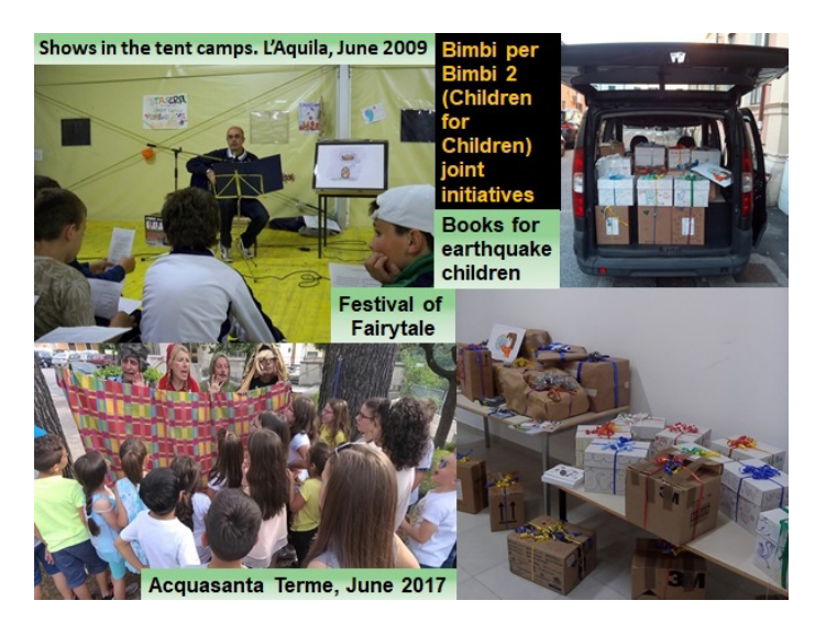
Fig. 3 - Fairytales in the tent camps: activities in the 2009 and 2016 earthquake sites.

voluntary basis, also consisted in a twinning between 39 classes of Primary and Middle Schools (ISCED 2) of Viareggio (LU) in Tuscany and the Primary and Childhood School of Acquasanta Terme (AP), hit by the 2016 seismic sequence. On the occasion of Christmas, the children from Tuscany gave more than 500 books and DVDs, coupled with drawings and letters to their peer in Acquasanta. Moreover, 6 bookshelves were added as Christmas gifts for children at tent camps (<a href="https://fiabeefrane.com/2016/09/24/bimbi-per-bimbi/">https://fiabeefrane.com/2016/09/24/bimbi-per-bimbi/</a>). At the end of the special venue, students showed great interest and learnt how important it is to share emotions and belongings, cooperating even at a distance in such extreme circumstances.